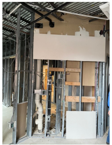
What will be the bathroom.