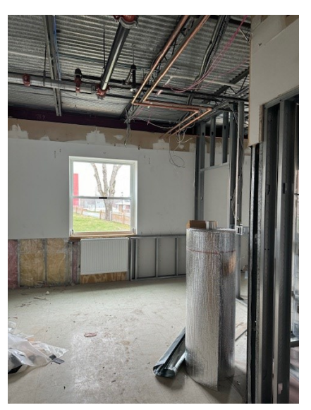
The Living room