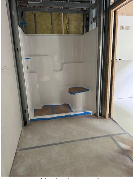
Part of he bathroom showing shower installed.