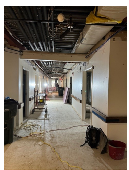
Hallway leading to the apartments.