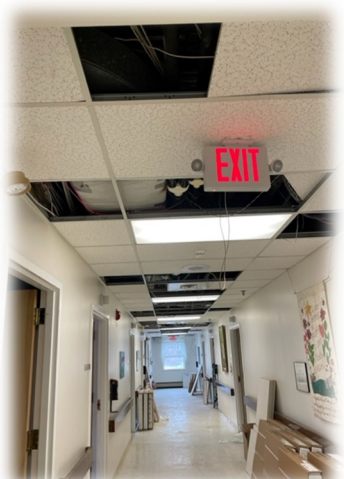
Working on installing the central air conditioning.

his is the first summer with central air conditioning at Holy Cross Health Center-such a gift to the residents and staff, especially facing such an experience of climate change. Everyone is so much more comfortable with this new system.